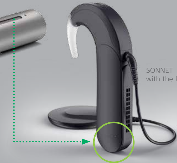
SONNET with the Roger 21

Roger 21 is a battery pack cover with an integrated receiver which can be used with SONNET. When paired with the Roger Pen (or other Roger-compatible microphones), it sends sound directly into the audio processor.